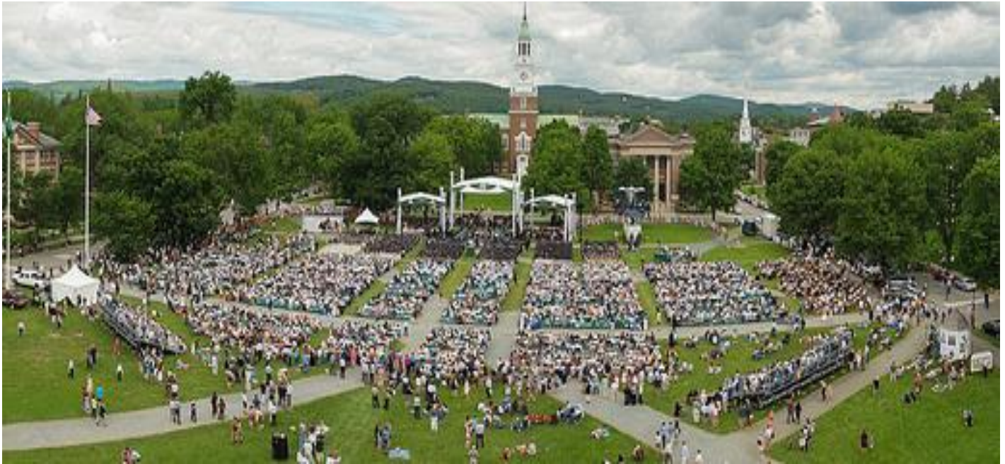
Dartmouth Commencement 2013

You must apply for the Extension of Eligibility and pay the premium for DSGHP coverage within thirty-one (31) days prior to the start of a plan year or the date you become eligible for an Extension of Eligibility. Students who qualify for Extension of Eligibility under the DSGHP may also purchase DSGHP coverage for their dependents (refer to the section entitled Dependent Eligibility). Please contact the DSGHP Office at the Dartmouth College Health Service for further information concerning the Extension of Eligibility.