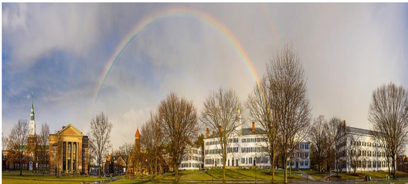
Double Rainbow Over Dartmouth College Summer 2013

The benefits described in this document are effective with the plan year beginning on September 1, 2019.